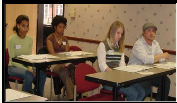
Anxious and attentive incoming scholars in attendance