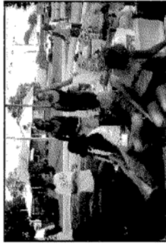
McNair Scholars Cookout