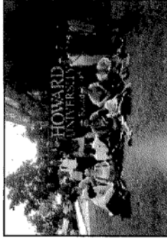
Visiting Washington D.C. area schools, monuments and museums